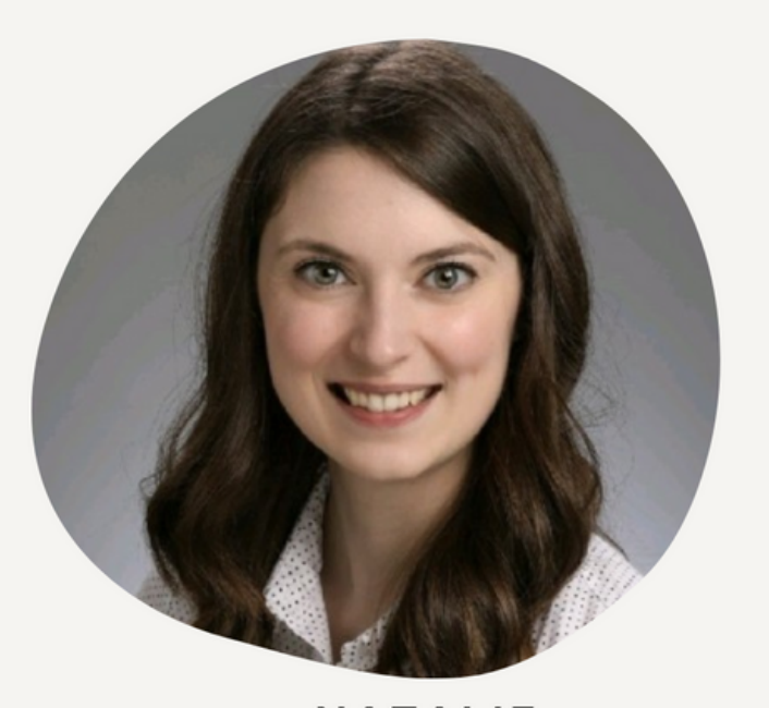
WHO YOU KNOW