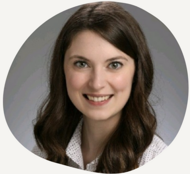
NATALIE WHO YOU KNOW